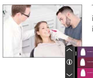
Tooth area shade determination in the cervical, central and incisal areas of natural teeth.

Shade determination of up to six anterior teeth for planning and monitoring of bleaching treatments.