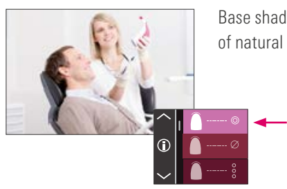
Base shade determination of natural teeth.

Determination of the average shade of multichromatic natural teeth.