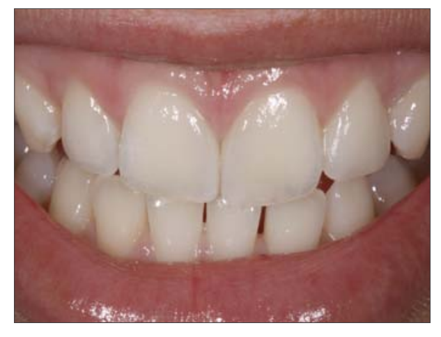
2. Closure of the gaps in the dentition and adjustment of the dental proportions have altered this young woman's appearance completely.