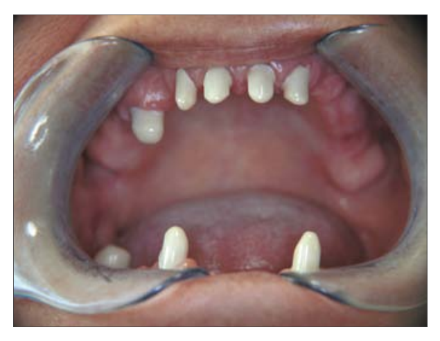
Initial situation: zirconium dioxide primary telescopes for telescope prostheses in the upper and lower jaw. The aim is to perform veneering using VITA VM LC and completion using VITA PHYSIODENS prefabricated teeth.

Everything a dental technician could wish for in a composite: true, stable shades, durability, and convenient handling.