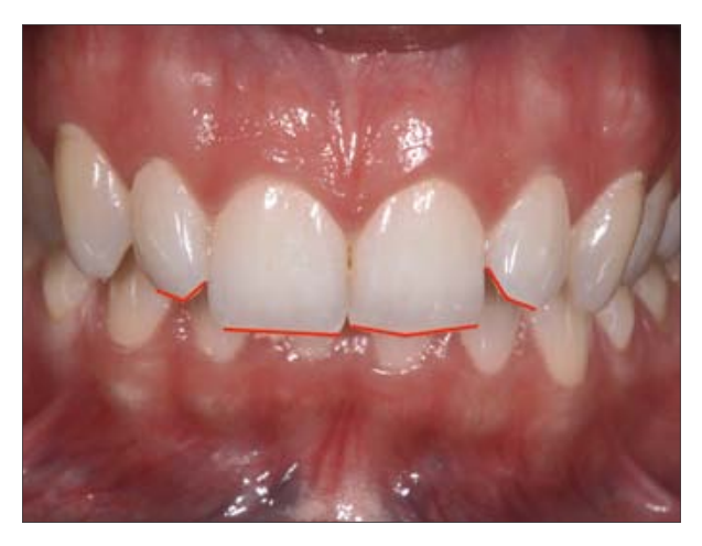
1. The red lines indicate the initial incisal edge which was considered unattractive and uneven.

Esthetically superior restorations with natural shade effects can be yours with VITA VM 13.