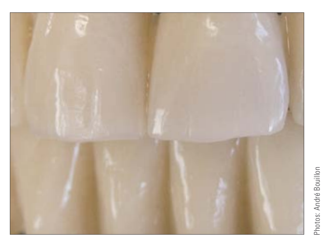
3. The final result: the practitioner and dental technician are satisfied, particularly with the natural appearance. Moreover, the patient is delighted with the oral comfort and esthetics of their restoration.

"I am very happy with the MODElling properties of the VM LC pastes, as they ensure good stability during modeling. The viscosity of the materials also make it easier for me to model the required shape quickly and easily."