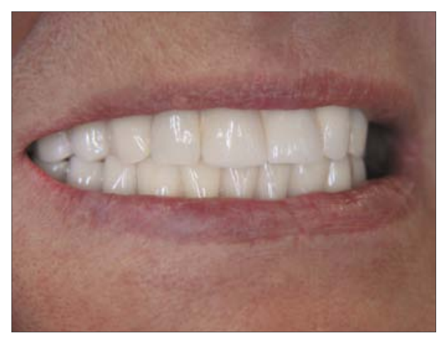
Composite veneers and prefabricated teeth are perfectly adapted to one another in terms of shade, providing harmony and balance between the restoration of the upper and lower jaw.