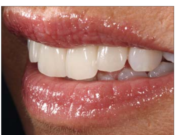
3. The final image shows a completely natural appearance, as if this smile had never been any different.