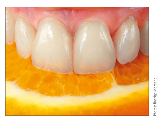
{\bf 3.}\ {\rm A}\ {\rm final}\ {\rm result}\ {\rm with}\ {\rm outstanding}\ {\rm esthetics}

"The Natural appearance of VITA VM 9 amazes me every time, particularly its fluorescence, its lightness, and the excellent adhesion it offers with the zirconia framework. It allows me to provide dental surgeons and patients with solutions that COMPletely exceed their expectations."