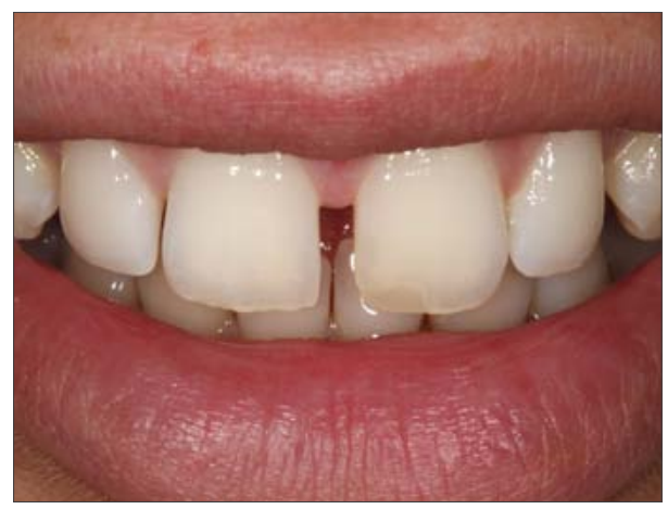
1. The initial situation shows a medial diastema and gaps in the upper jaw dentition as well as obvious composite filling of the fractured mesio-incisal edge of tooth 21.

How four no-prep veneers made of VITA VM 7 helped pave the way to the catwalk.