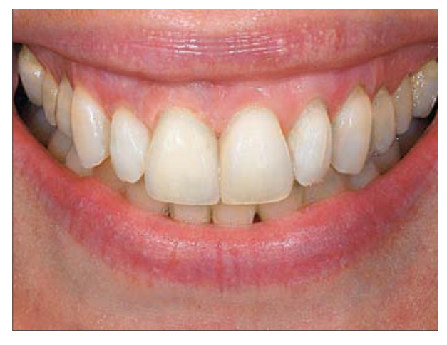
2. An esthetically pleasing final result following gingival build-up and restoration with an all-ceramic crown fabricated using VITA VM 9.