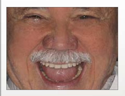
A hearty laugh. A patient who has been wearing a VITA OMEGA bridge for 18 years.

VITA OMEGA was a considerable improvement on VMK 68, particularly with regard to shades. Compared to its predecessor, it offered vastly superior options in terms of design for natural-looking restorations, making it particularly appealing to users for whom only the best would do.