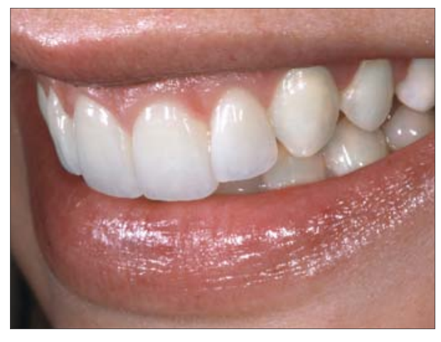
2. The incisal edge and tooth axes of the final restoration in situ have been evened out. The restoration cannot be distinguished from the natural dentition.