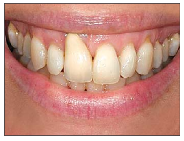
1. The initial situation shows tooth 11 with significant gingival recession.

With VITA VM 9, you can meet high expectations in a reliable and reproducible fashion